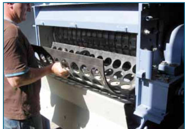
Fig. 5: Screen support hydraulically controlled, convenient, fast screen change