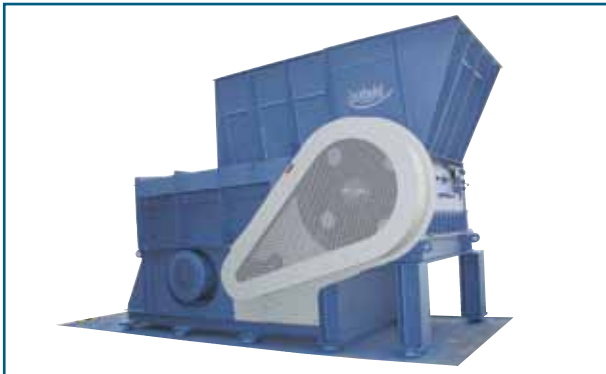
Fig.1: EWS 45/120

The Herbold single-shaft shredder is a further development of the HR shredder series for high throughputs and difficult applications.