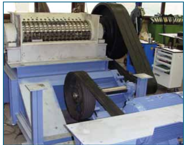
Fig. 4: V-belt drive by countershaft drive