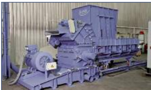
Fig. 1: SML 60/100 HB with additional roller feeding device

The main advantage of this new development is its space-saving design since only one size-reduction step is necessary. In addition, only one size-reduction step also makes cleaning with colour and material changes much easier: there is no intermediate conveying by means of a belt conveyor, where cleaning is extremely difficult. Only one machine will need knife change and maintenance, thus reducing maintenance times and costs.