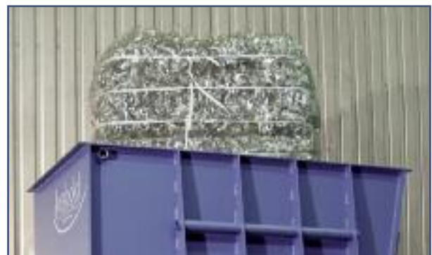
Fig. 3: Film bales