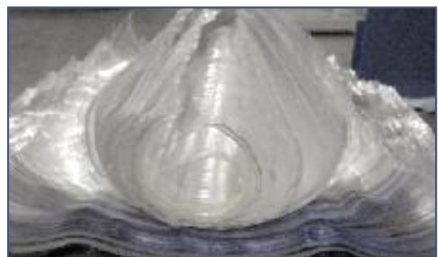
Fig. 2: Cutt open film rolls

Typical input material for the granulator of the HB series :