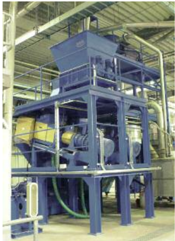
Two EPS 75 with distribution hopper

should not exceed 30 mm and should not be thicker than 2 mm. Materials prone to compacting may require loosening after dewatering before further processing. In many cases the dewatering screw is combined with a friction washer or with a mechanical dryer followed by a simple thermal dryer. In many applications the use of a thermal dryer is not required when using a Herbold plastcompactor.