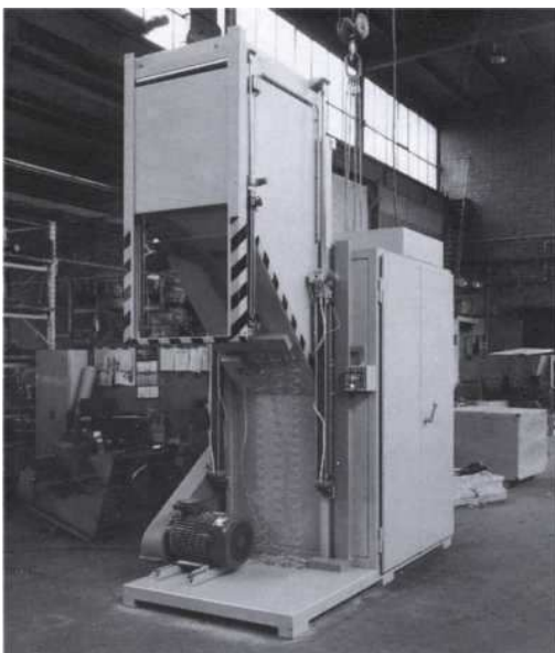
grinder with hopper in operating position