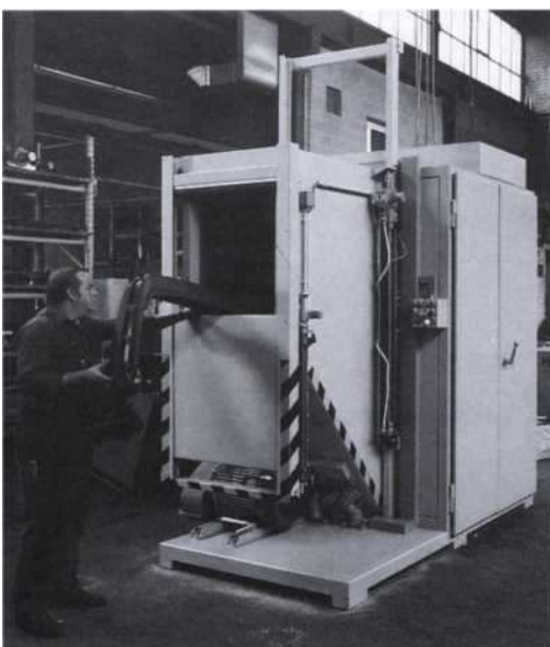
grinder with hopper in feeding position