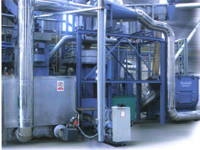
Hot Wash Step