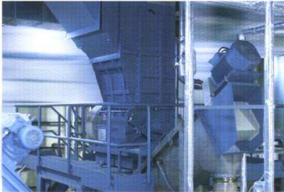
Washing Mill with Friction Washer